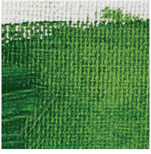
UNDERTONE The color applied thinly or diluted - generally more transparent.