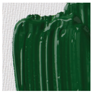
MASSTONE The color straight from the tube – rich and concentrated.

How long will it resist fading? Each pigment is rated on scale by the American Society for Testing & Materials (ASTM). Basics paints are all ASTM I (excellent) or II (very good) and considered permanent and lightfast* for 50-100+ years in gallery conditions.